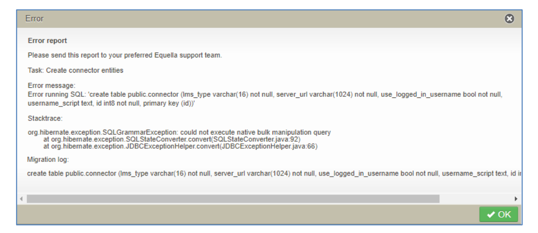
Figure 15 Example migration error report

Depending on the type of error and the administrator's experience with EQUELLA upgrades, either resolve the issue and attempt the migration again by clicking the Migrate link, or contact Client Support.